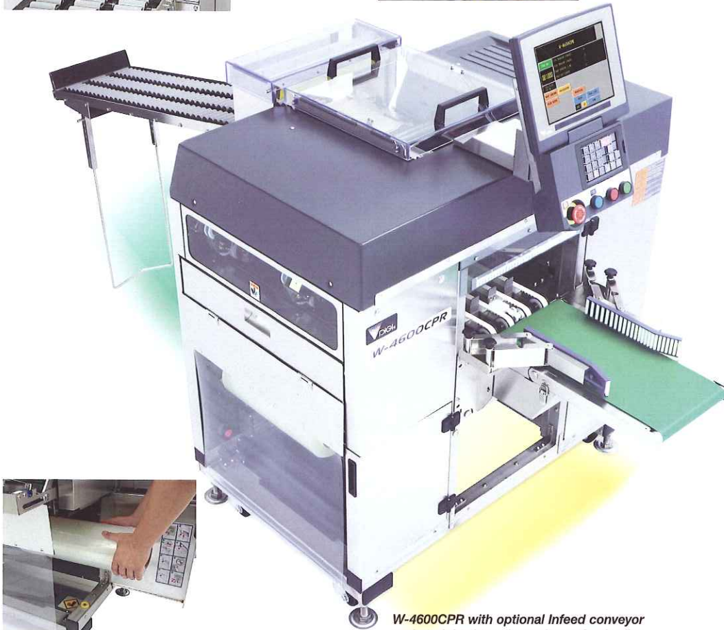
W-4600CPR with optional Infeed conveyor and straight-through gravity outfeed roller