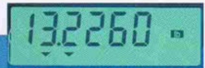
Selectable weight units (g, kg, oz or lb.)