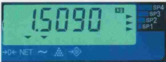
Check weighing with filling function